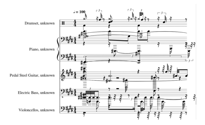
Fig. 2: A generated chunk.

To make the accompaniment for a song, each 4-bar phrase (we refer to them as chunks ) is matched to a line in the lyrics. The chunks are then transposed to the same key and put together to form a complete piece. The MIDI file is sent to a Pd patch, see section 4.1. The specific melodies that maps to the lyric lines are left for the karaoke singer to come up as they hear the accompaniment.