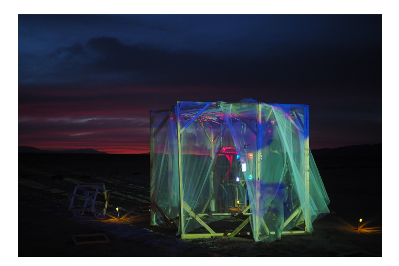
Fig. 5: Participants singing in the karaoke.