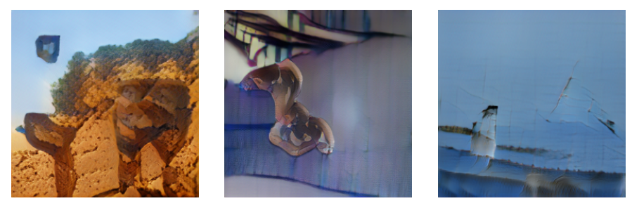
(a) Desert de Bebe

tnGAN (Xu et al., 2018), generating images that condition on the lyrics of a song one line at a time. We then interpolated between the images using Adobe's morphing algorithm to create a smoother transition. We used the model trained on the MSCOCO dataset (Lin et al., 2014) which given specific descriptions of common objects will generate realistic images. In our case, the images are often abstract yet, to various extents, resemble what is written in the lyrics to the human eye. Figure 3 shows three examples with the strongest correlation from word to image.